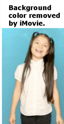
Background color removed by iMovie.